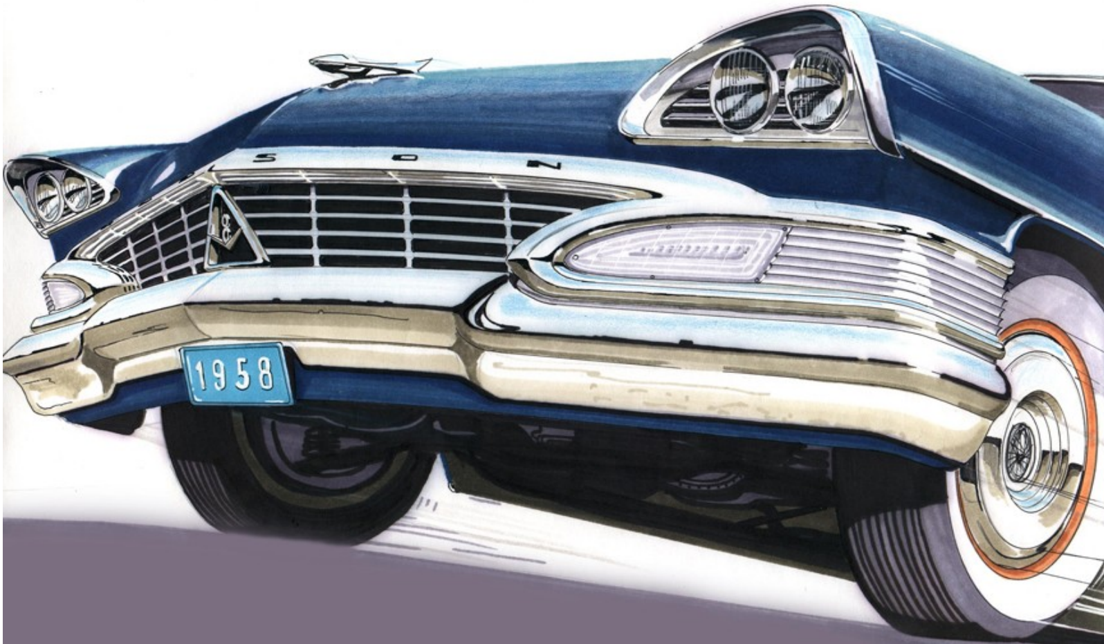
1958 Hudson Hornet... Squirrel view!