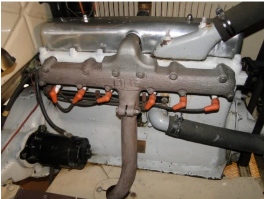
Before new exhaust, plugs & wires