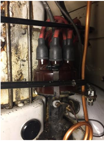
After new distributor & wires