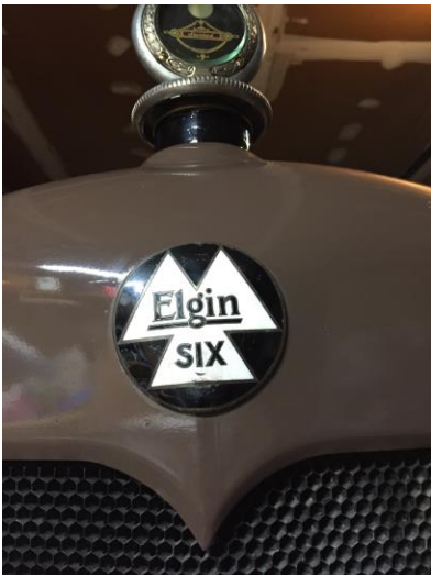
Elgin Logo/Badge & old motor meter