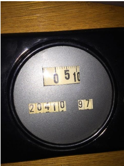
Speedometer (not working)