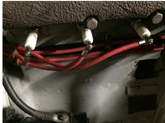
New plugs & wires