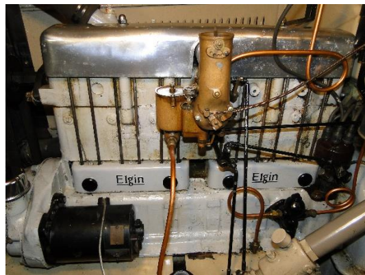
Before new carb, distributor, and wires