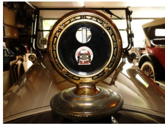
New motor meter